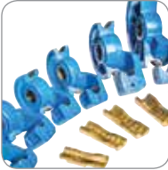
Tube & Pipe Tooling Kits