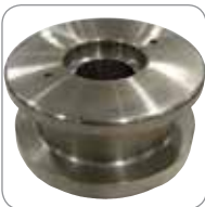
Roller Counterbending Die