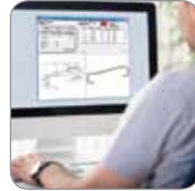
Easy Part Layout Software