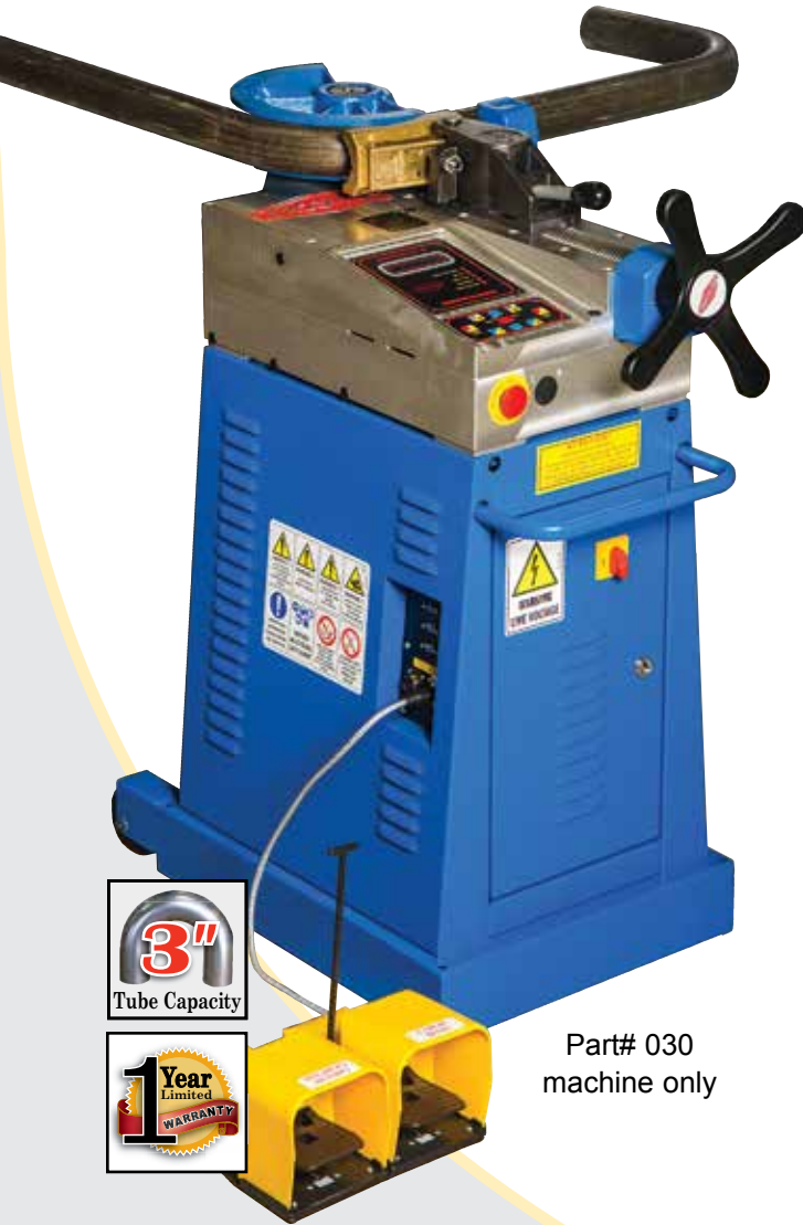
Part# 030 machine only

"Large Radius" Tube Kit only Part# TUBEKIT1