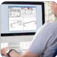
Easy Part Layout Software