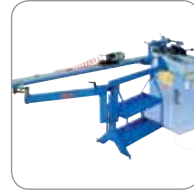
Two Axis Positioner