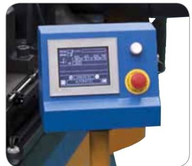
Easy touch screen bend angle programming.